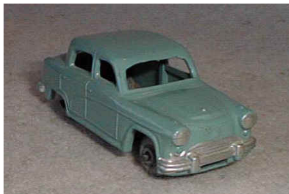
Matchbox No 36 Austin A50