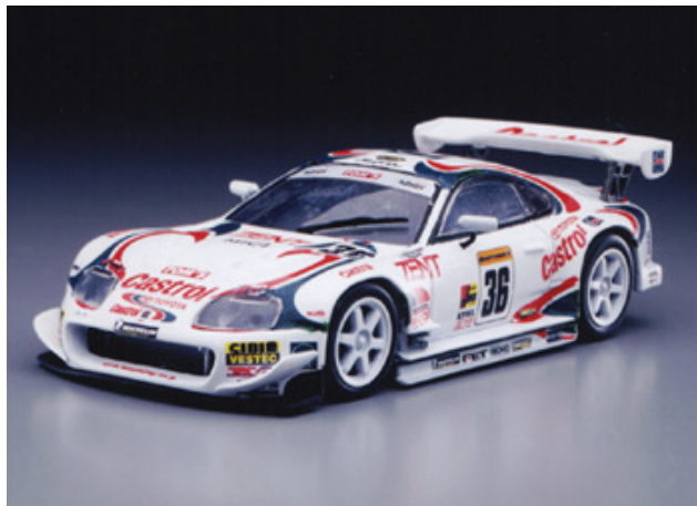
EBBRO 1/43 Diecast Japan Toyota Supra JGTC

Miniature Auto is the bi-monthly newsletter of The New Zealand Model Vehicle Club (Inc)