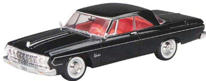
Left: Eagle Collectibles UNHV 1450 1/43 Scale '64 Plymouth Belvedere Hard Top. Also listed 2 racing versions 'Color to be determined' Could one of these be a #43 STP car