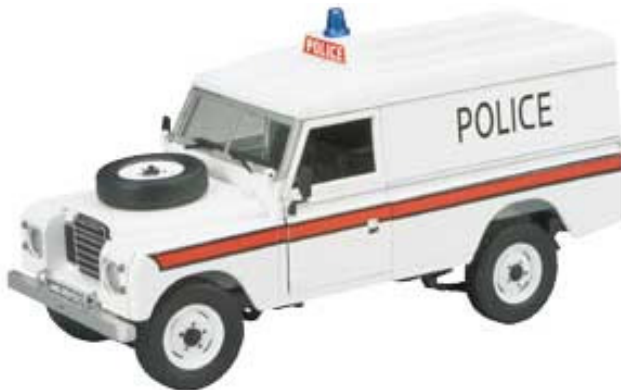
Eagle Collectibles 1/18 UNHV4409 Land Rover Series 3 109 Police Patrol