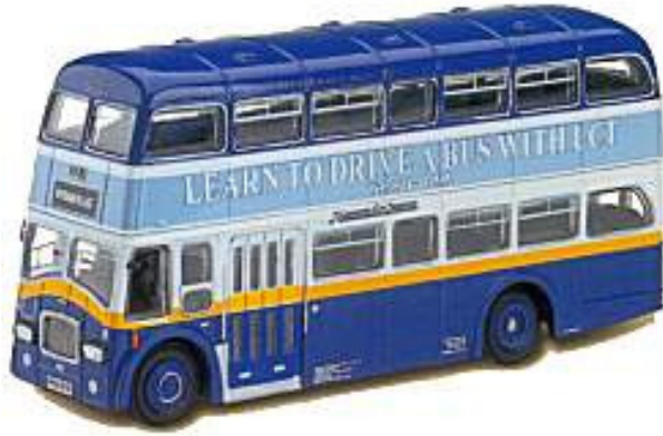
Left: OOC 41907 1/76 Scale Leyland PD3 'Queen Mary' Lancaster City Transport