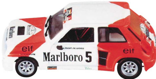
Right: Eagles Collectibles UNHV 1716 1/43 Scale Renault R5 Turbo Rally Var '82 Driver Alain Prost. Note the Marlboro Sponsorship, a rare sight these days