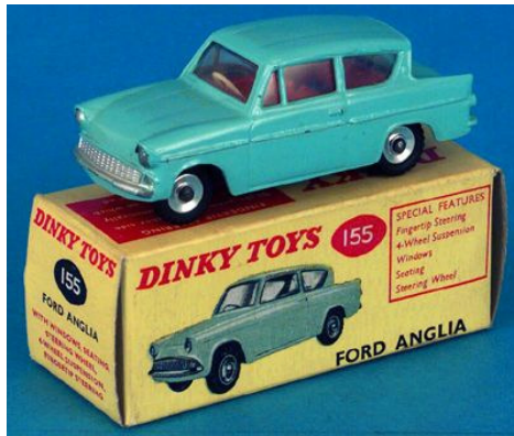
Above: Dinky 155 Ford Anglia