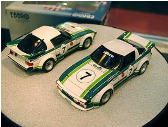
Above: Pre Production samples of the new ebbro RX7 Daytona 24 hrs GTU Class entries.. I can't wait for these to go on sale.