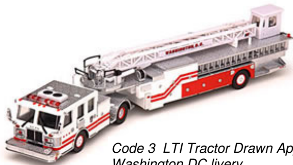
Code 3 LTI Tractor Drawn Appliance Washington DC livery.