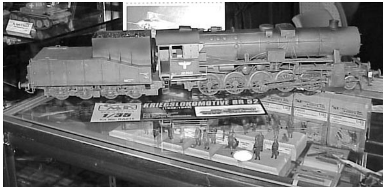
Not Your Average Railway Model (See IMHE Report)

Miniature Auto is the bi-monthly newsletter of The New Zealand Model Vehicle Club (Inc)