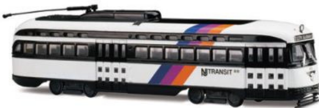
Corgi US55020 PCC Car New Jersey Transit