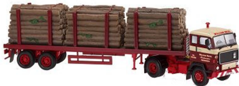
Below: 13102 Volvo Log Trailer in William Nicols Livery