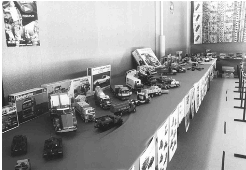
Some Commercial Vehicles at the Otago Branch Kitset Expo

A publication for and by collectors and builders of model vehicles