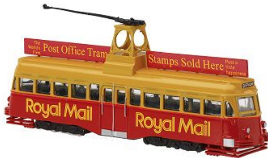
Left: OM44006 Blackpool Tram in Royal Mail livery