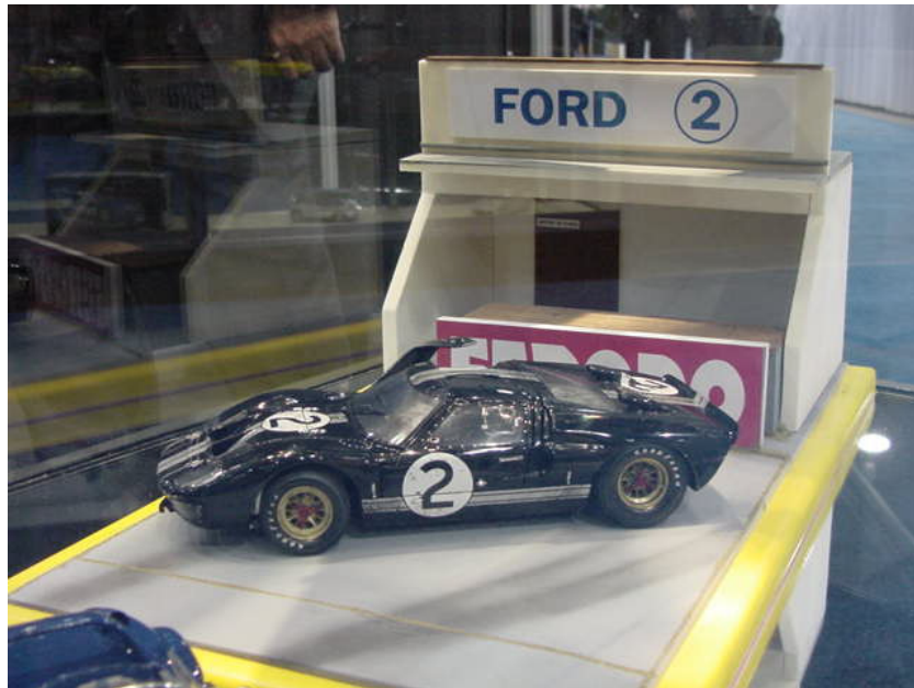
Above: Exoto new 1:12 scale Ford GT40 Diorama featuring 1966 Le Mans winning car of McLaren/Amon