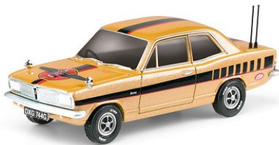
Left: Vanguards VA8701 Vauxhall Viva HB Boy Racer. I guess Pommy Boy Racers were more easily pleased than the colonies – Ed