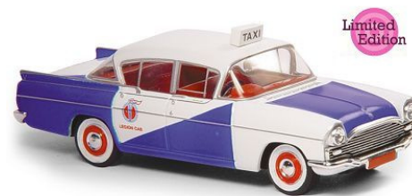
Above Left: Vanguards VA3808 Vauxhall Victor F Series Hidden Treasure