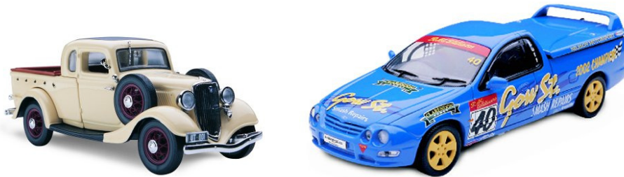
A pair of Ford ute releases from Classic Carlectables. On the left a 1934 model and on the right Warren Luffs 2002 Brute series winning AU XR8