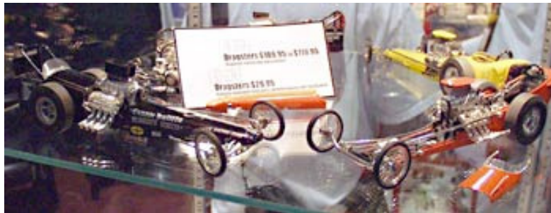
Above: New releases in the GMP range of Dragsters