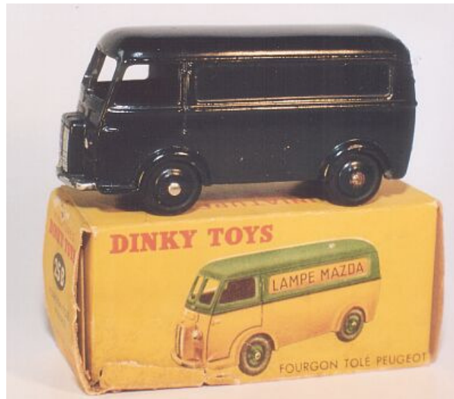
An Adventurous French Dinky Peugeot Van

A publication for and by collectors and builders of model vehicles